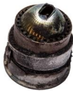
Fire Rated Housing with directional Insert