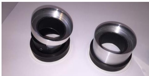
Intumescent strips inner edges of inserts

The pictures below show the Fire Rated Housing before and after the activation of the intumescent material.