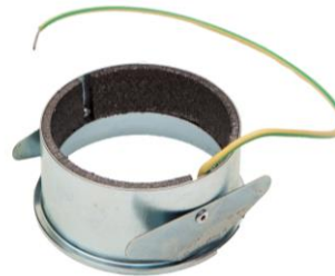
Intumescent strip Fire Rated Housing