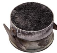
Standard Fire Rated Housing

The pictures above clearly show how the Levello Fire Rated System completely seals the aperture in the ceiling and any luminaire components are encapsulated preserving the integrity of the fire barrier.